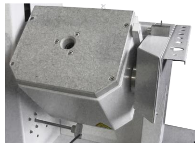
Tilting oven to facilitate cleaning of the chamber